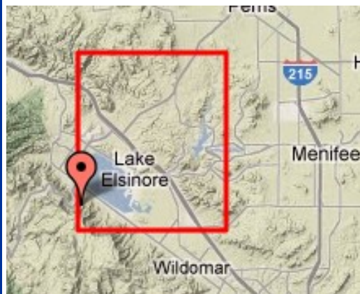
Figure 1 - VIC model grid cell used to determine data for Lake Elsinore analysis

Figure 2 shows the distribution of projected average annual volume for two future periods, 2000-2049 and 2050-2099, based on 112 different climate change projections. The two future periods were also analyzed with the addition of the EVMWD project. For the 2000-2049 period there is a >50% chance that the average annual lake level will meet the minimum goal, adding in the EVMWD project brings that likelihood up to >75%. For the 2050-2099 period there is a <5% chance that the minimum goal will be met, adding the EVMWD project brings that up to a >25% chance. Both periods are likely to stay above low lake level, with the 2050-2099 period having <10% chance of drying up completely.