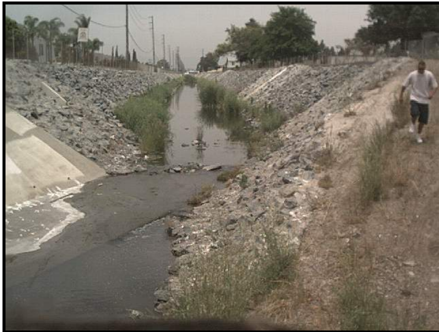
Fig. 3: Non-Contact Recreational Activity at Site #1

Figures 3 and 4 provide illustrations of typical non-contact recreational activities (e.g. walking) that occurs in shallow stormwater channels like the Santa Ana Delhi.