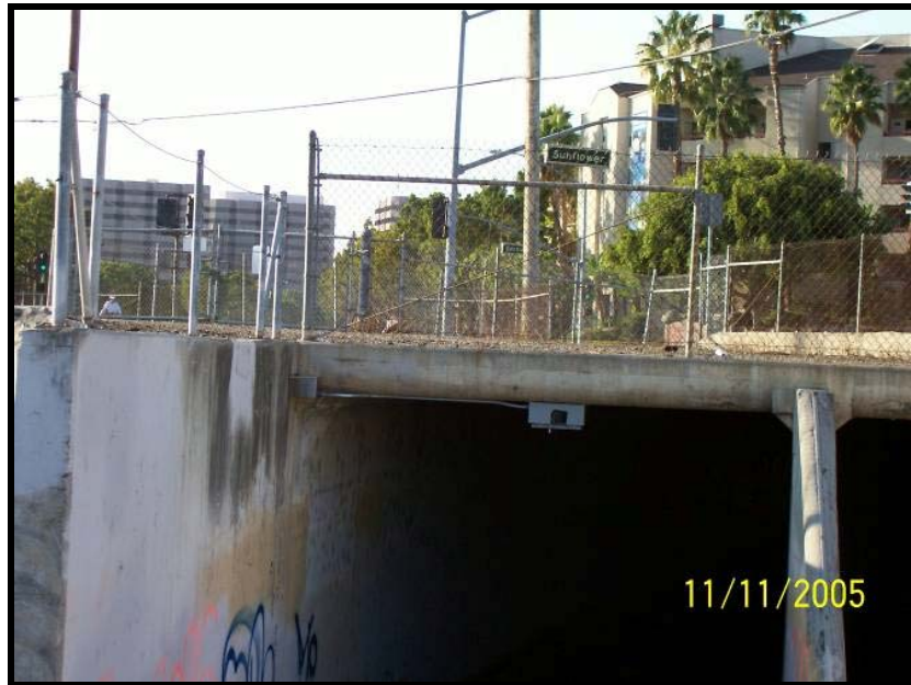
Fig. 6: Wireless Video Camera Mounted Under Bridge at Site #1 (Sunflower Ave.)