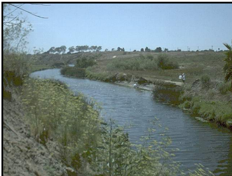
Fig. 7: Water Contact Activities at Santa Ana Delhi Site #3

Of the more than 63,000 photographs taken, representing nearly 16,000 hours of potential recreational opportunities, only three pictures (<0.005%) show anyone actually being in a position to ingest water, even accidentally. In one instance, a boy is standing on stones as he crosses over the creek (see Fig. 2 above). In another, the person is crouching on the stream bank washing their hands after lunch (see Fig. 7) or illegally boating in the nature preserve (see Fig. 8).