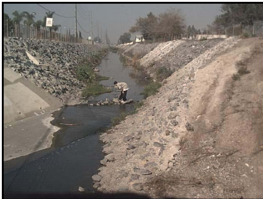
Fig. 2: Water Contact Recreation at Santa Ana Delhi Site #1

Figure 2 shows a picture of the only recreational water contact event observed at Site #1 (near the schoolyard). Despite the fact that the child is actually standing on a stone in the middle of the creek, it is difficult to infer that full body contact recreation is likely to occur or that there is a serious risk of immersion or significant ingestion.