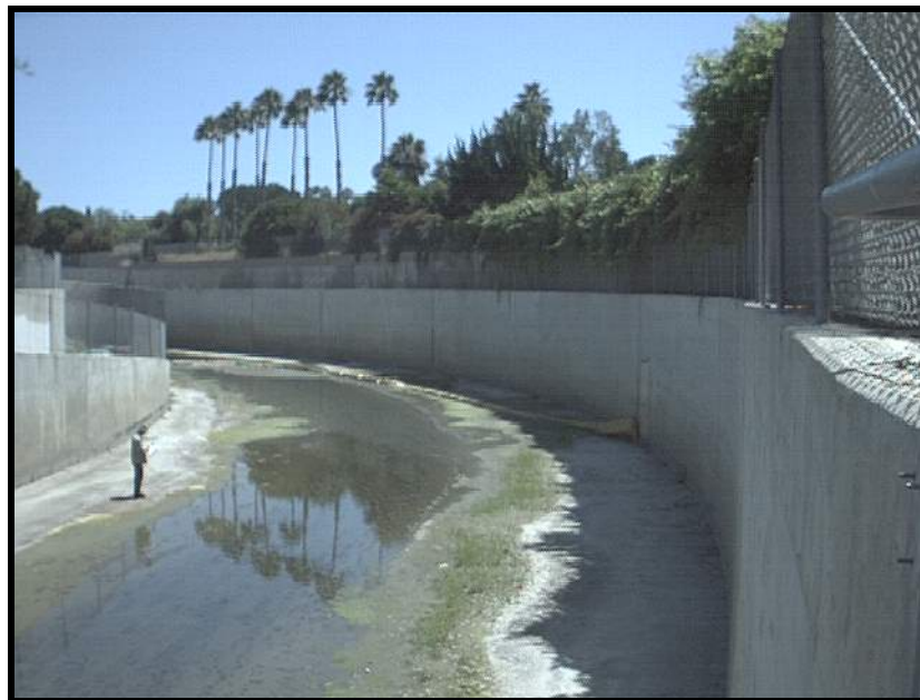
Fig. 5: Santa Ana Delhi Channel at Mesa Road in Orange County, California

All of the pictures in Figures 2 thru 5 are actual images collected and transmitted by the wireless video cameras installed for the UAA study. Figure 6 shows the camera installed at Site #1.